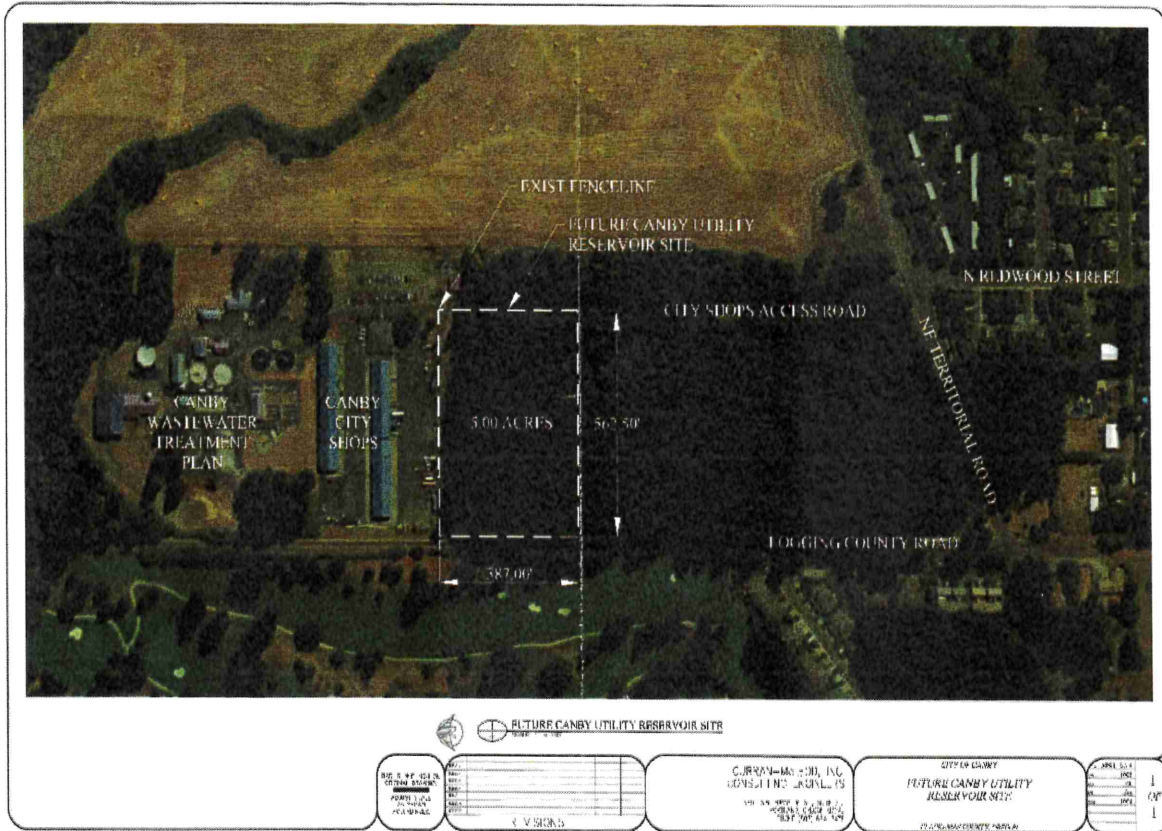
Exhibit C Partitioned Property General Description